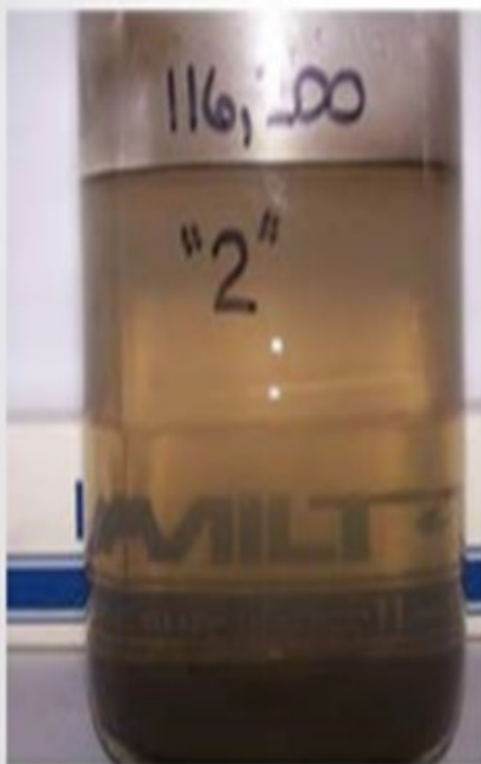
Normal Desalter Brine