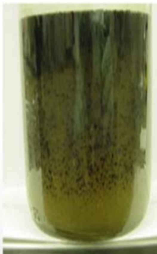
During Asphaltene Precipitation Event