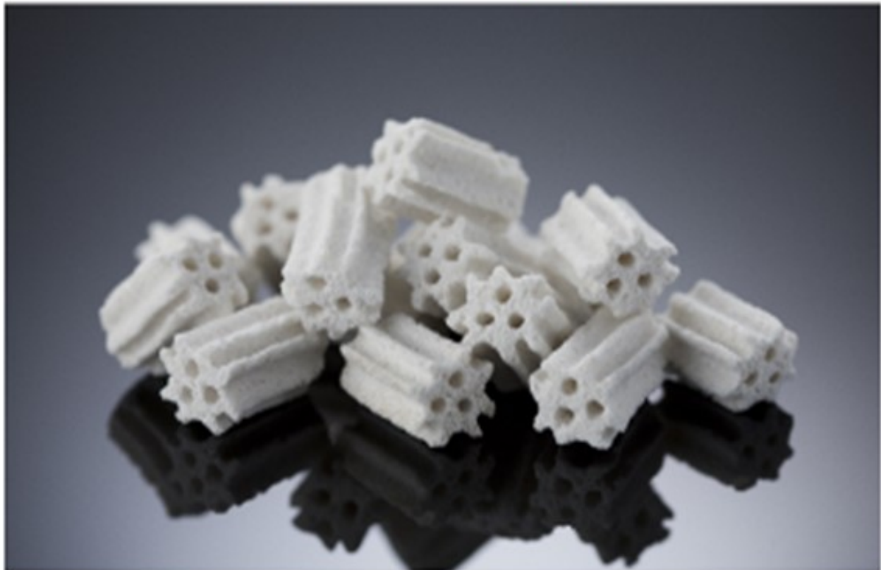
Figure 1. TK-26 TopTrap™

When grading for iron, the graded bed system must be able to handle the iron in all its sizes Haldor Topsoe, Inc.'s shape-optimized TK-26 TopTrap™ is the successor of our very successful TK-25 TopTrap™. The optimized shape of TK-26 TopTrap™ provides an improvement in pickup capacity of 21%. TK-26 TopTrap™ is designed to load with an interstitial void of 61% and an additional 25% void in the pore system, for a total void volume greater than 85%. This gives TK-26 TopTrap™ the ability to trap not only larger quantities of deposits but also the ability to trap the smaller sized particulates. Larger-sized material deposits in the interstices between the individual particles. Fines or smaller-sized materials enter the TK-26 TopTrap™ pore system and are trapped within the structure of the particle itself. Not all grading is created equal, and it is not just a question of creating a high interstitial void fraction. Porosity and surface area are also important functionalities for graded bed material designed to trap particulate matter. Please note that the material trapped in the pore system of TK-26 TopTrap™ will not add to the pressure drop. This is the reason why TK-26 TopTrap™ is more effective in mitigating pressure drop issues than other ceramic trap materials in the marketplace.