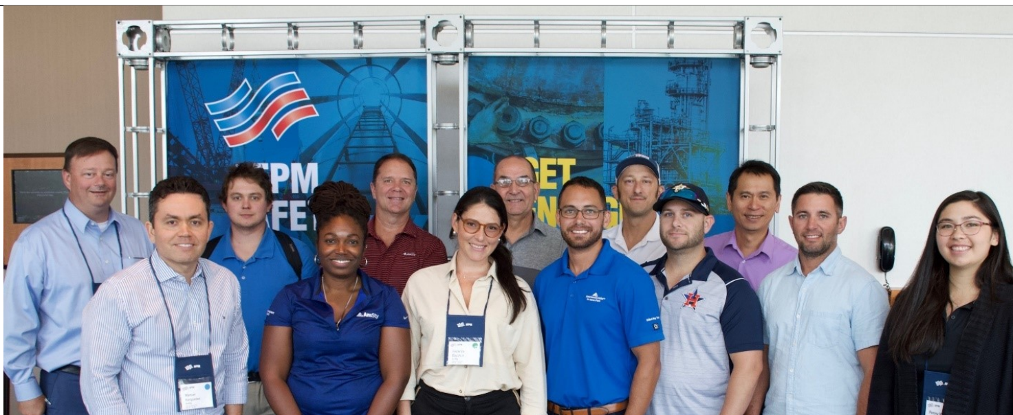
A team from Americas Styrenics takes part in the 2019 Walk the Line industry sharing workshop outside of Houston, TX.